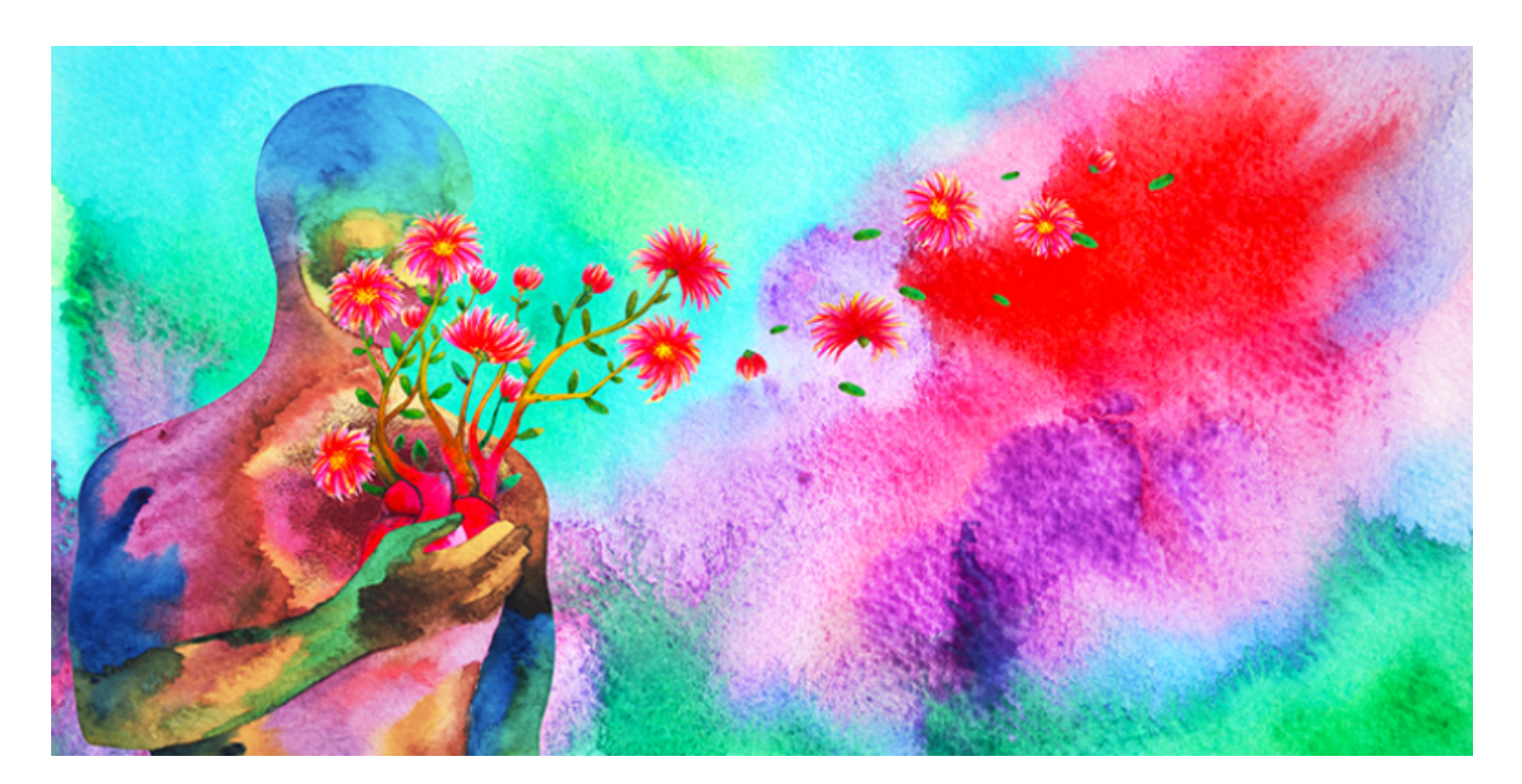
Your heart energy is the real you!

energy that is based on loving, respecting, and accepting ourselves and others.